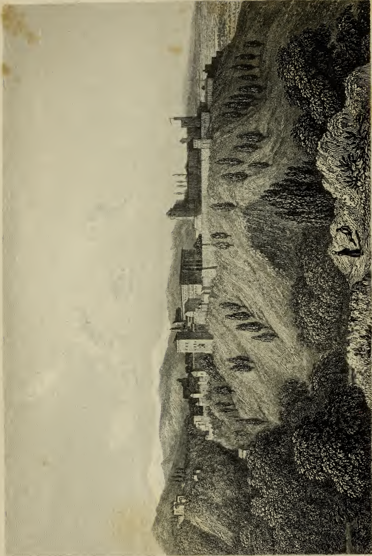
Engr'd by Edw'd Tindal.